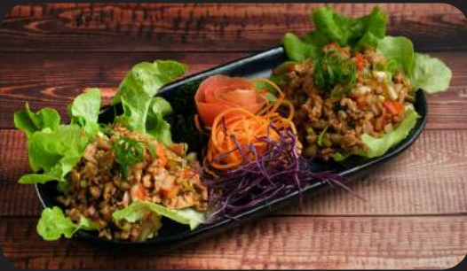
Chicken Lemongrass Lettuce Wrap ชุดเมี่ยงไก่ตะไคร้ (2 pcs) $19.9

Grilled squid served with Thai chilli sauce.