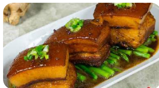
Pork Belly with Sauce

Stir fried Clams with chilli paste, coconut cream, Thai Basil, fingerroot and green pepper.