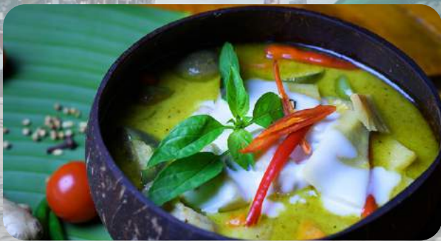
Chicken Curry แกงเขียวหวาน

Chicken breast with green curry paste with vegetables, bamboo and basil.