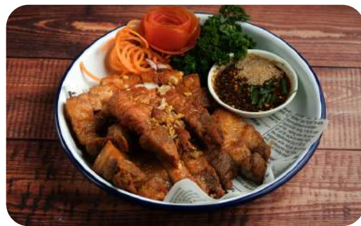
Deep fried Pork Belly

Steamed squid and cabbage served with Thai sauce.