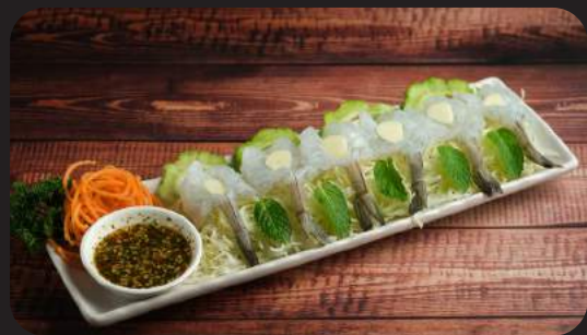
Raw Prawn Salad กุ้งแช่น้ำปลา (6 Pieces) $19.9

Deep fried home made Thai style pork ribs served fresh chilli, fresh cabbages, pickle gingers.