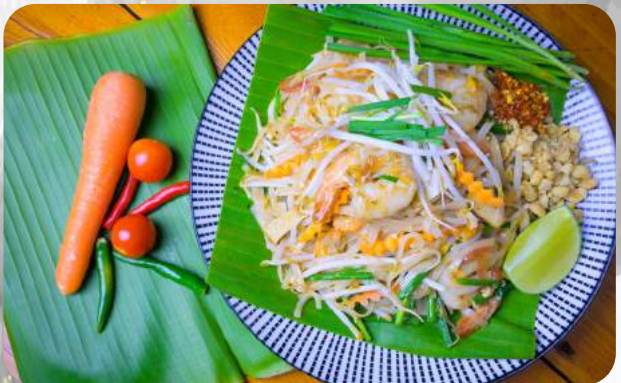
Pad Thai ผัดไทย Stir fried rice noodles with egg, grout peanuts, bean sprouts, and garlic chives Served with Chilli and peanuts.