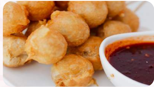
Deep Fried Fish Ball ลูกชิ้นปลาทอด

Grilled marinated chicken skewers served with peanut sauce.