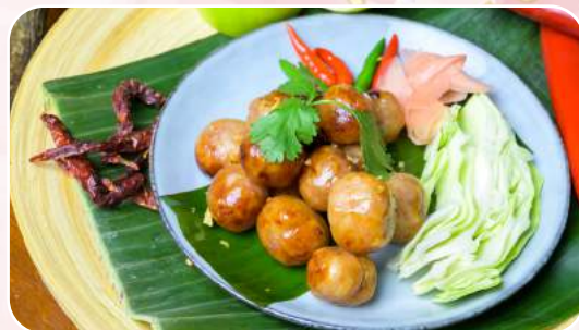
I-Saan Sausage ไส้กรอกอีสาน

Grilled fish ball Served with Thai chilli sauce.