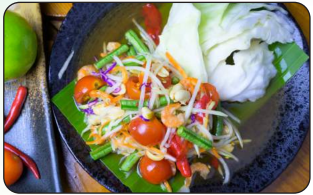
Som Tum Thai ส้มตำไทย

Green papaya salad with fermented fish, green bean, chili, lime, tomato and salted crabs.