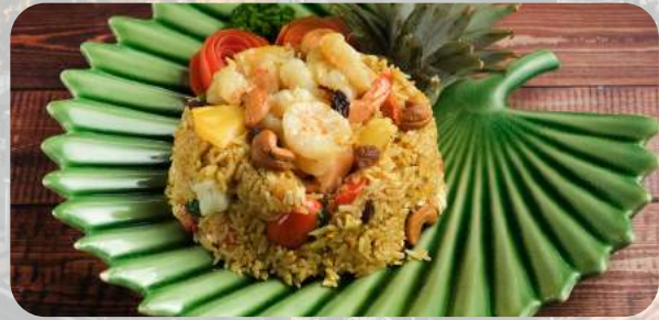
Pineapple Fried Rice ข้าวผัดสับปะรด $24.9

Your own choice of meat stir fried with fresh tomato, Pineapple, capsicum and onion.