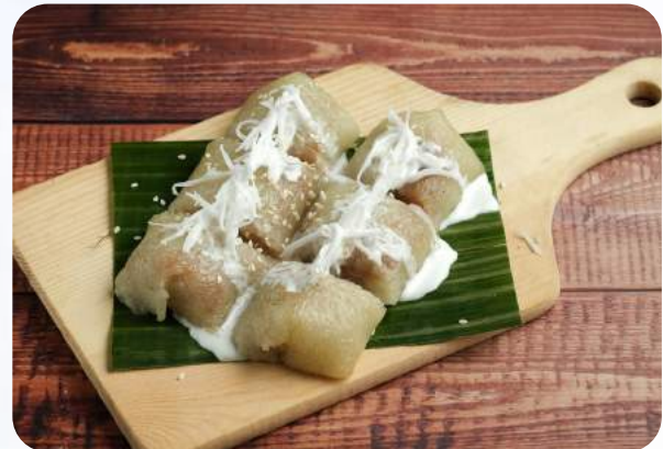
Coco Sticky Rice ข้าวต้มมัด

Vanilla ice cream covered with breadcrumbed, Served with strawberry syrup, whip cream and chocolate waffle.