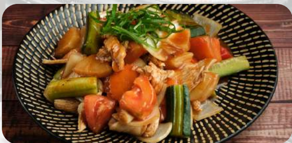
Sweet And Sour ผัดเปรี้ยวหวาน

Your choice of meat stir fried with fresh ginger, black fungus, onion.