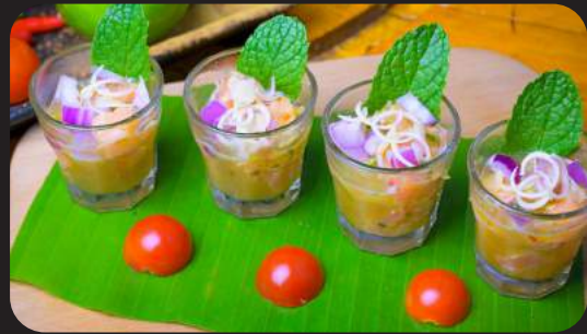
Salmon Shot แซลมอนชอท (4 Shots) $21.9

Chicken minced stir fried with lemongrass, garlic and capsicum served with iceberg lettuce.