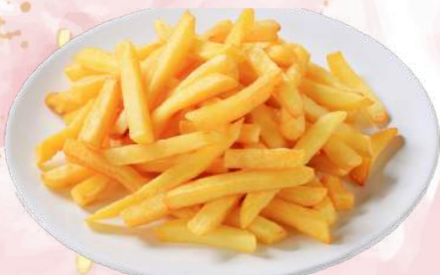
French Fried V

Roast peanut mixed with dry chili and kaffir lime leaves.