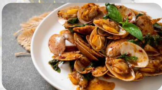
Stir Fried Clams with Roasted Chili Paste

Deep fried Pork belly cooked with fish sauce. Served with Thai tamarind sauce.