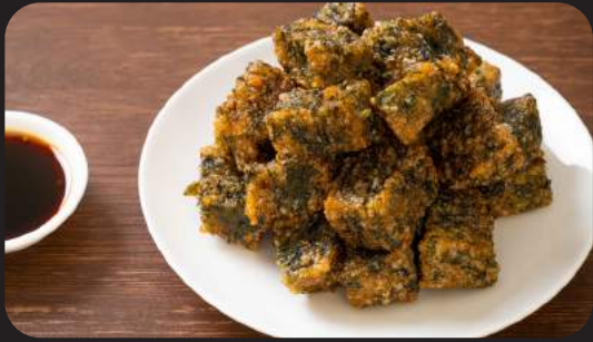
Garlic and Chives Cake V กวยช่ายทอด $14.9

Deep fried garlic and chives cake serve with Thai sweet soy sauce.