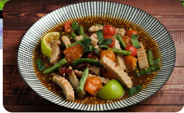
Tum Moo Yor ตำหมูยอ