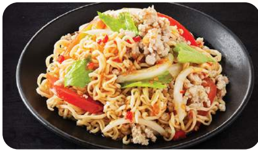
Yum MaMa ยำมามา $24.9

Crispy pork with Fermented fish sauce, chilli, lime juice, fish sauce, palm sugar, onion, shallot, mint, coriander, peanuts and tomato. (can served without chilli)