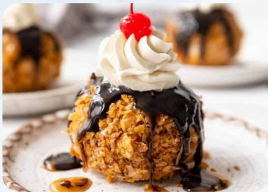
Deep fried Ice Cream ไอติมทอด

Glass Jelly with fresh milk top with brown sugar and crushed ice.