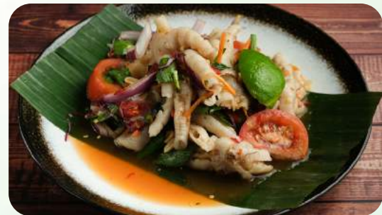
Yum Chicken feet ยำตีนไก่ $25.9

Mixed seafood with chili, lime juice, fish sauce, palm sugar, onion, shallot, mint, coriander, white fungus, peanut and tomato.