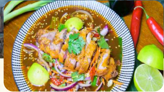
Yum Crispy Pork ยำปลาร้าหมูทอด $26.9

Glass noodle with pork mince, chili, lime juice, fish sauce, palm sugar, onion, shallot, mint, coriander, pork sausage, white fungus, peanuts and tomato.