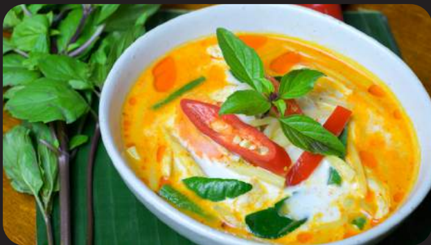
Red Curry แกงแดง

Choice of your meat with panang curry paste, coconut milk with vegetables, kaffir lime leaf and peanut.