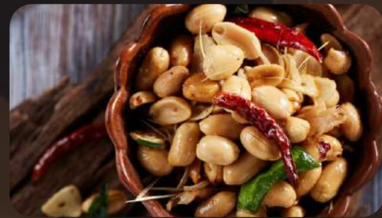
Chilli Nut With Herbs V

Deep fried fish ball bombs served with homemade chili sauce.