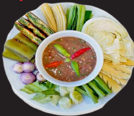
Spicy Shrimp Paste Dip (Nam Prik Kapi) and steamed vegetables