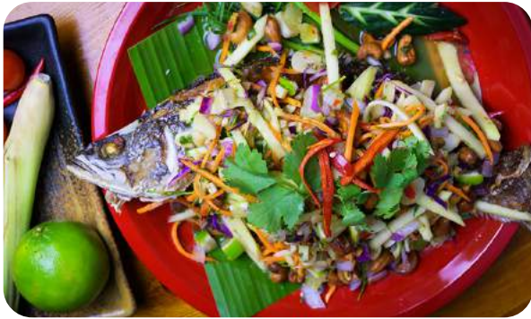
Barramundi In Jungle