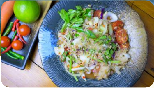
Yum Woon Sen ยำวุ้นเส้น $24.9

Glass noodle with pork mince, chili, lime juice, fish sauce, palm sugar, onion, shallot, mint, coriander, pork sausage, white fungus, peanuts and tomato.