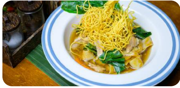
Lad Na ราดหน้า Stir fried flat noodles in gravy sauce, vegetables, egg and your choice of meat