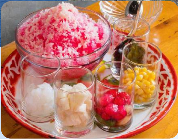
Snow Ice น้ำแข็งไส