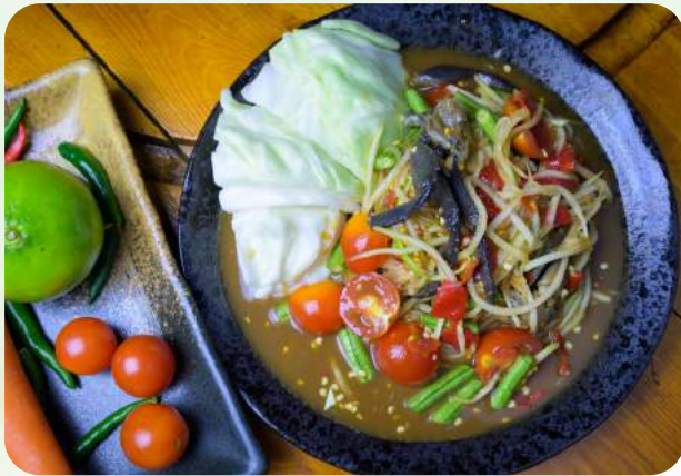
Som Tum Lao ส้มตำปูปลาร้า $17.9

Green papaya salad with fermented fish, green bean, chili, lime, tomato and salted crabs.