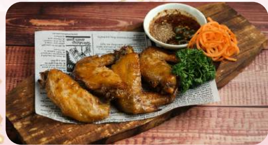
Grilled Chicken Wings ไก่ย่าง (4 pcs) $13.9

Banana prawns wrapped in a delicious potato noodle served with our special tangy dipping sauce.