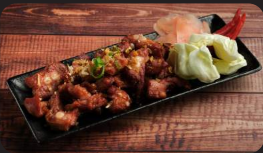
Crispy Fried Pork Ribs GF แฮมหมู ทอดกระดุกอ่อน $19.9

Fresh salmon top served with our homemade chilli sauce and salad.