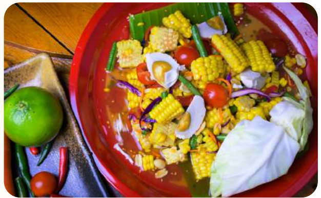
Som Tum Corn ส้มตำข้าวโพดไข่เค็ม

Salad shredded green papaya and lemon dressing with peanut, chilli, dried shrimp and raw salted crabs.