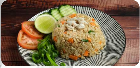
Thai Fried Rice ข้าวผัด Fried rice with egg onions, Chinese broccoli, tomato and spring onion.