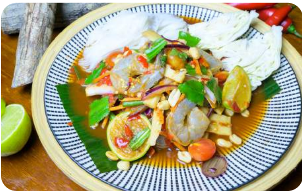
Tum Raw Prawn ตำเกาเหลากุ้งสด

Pork sausage with chili, lime juice, fish sauce, palm sugar, onion, shallot, mint, coriander, white fungus, peanuts and tomato