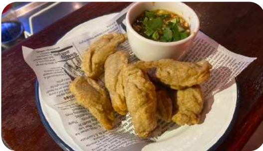
Deep Fried Fish Ball Bombs