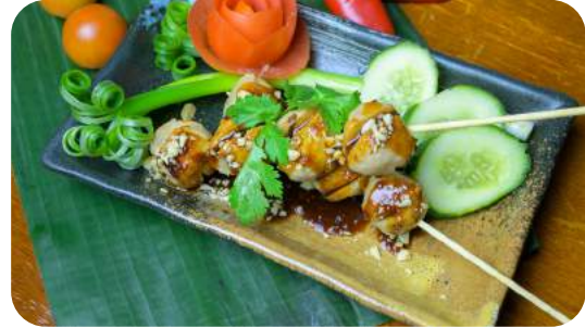
Grill Pork Ball Stick ลูกชิ้นหมูปิ้ง

Grilled pork served with Thai chilli sauce.