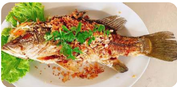
Barramundi with Crispy Garlic ปลากระพงทอดกระเทียม $33.9

Deep fried barramundi served sweet and sour sauce with vegetables.