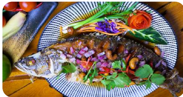
Barramundi With Sweet And Sour sauce ปลากระพงราดซอส $35.9

Deep fried barramundi served Thai Herb and home made Thai sauce.