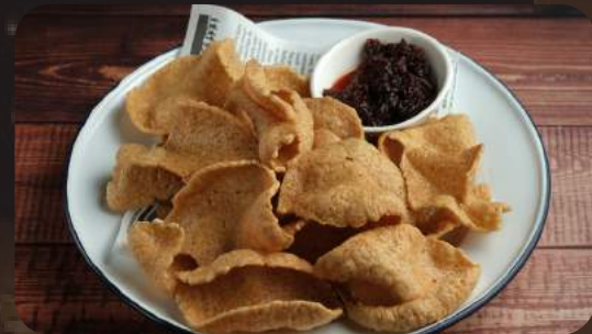
Crisp Rice Cracker with Chili Jam