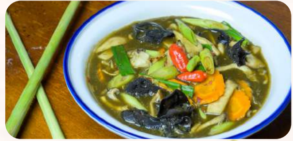
Thai Spicy Mushroom Soup

Thai spicy and sour broth of mixed seafood with lemongrass, kaffir lime leave, and a generous amount of chilli and lime juice.