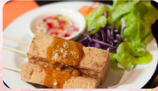
Deep Fried Tofu Satay V

Grilled tradition pork sausage in I-saan style, rice, herb, spice, garlic and pepper served with pickle ginger and fresh cabbage.