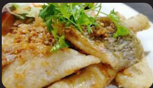
Add Barramandi Deep Fried fillet

Deep fried barramandi fillet served with chilli sauce