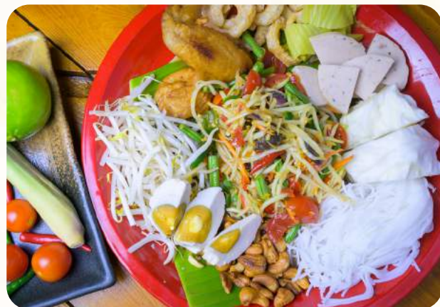
Som Tum Yok Tad ส้มตำยกถาด $32.9

Salad corn and lemon dressing with peanut, carrot, chili, dried shrimp and salted crabs.