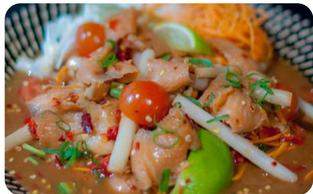
Tum Best day (ตำแซลมอน)

Raw prawn with fermented fish, red onion, chilli, lime, tomato, peanut and cilantro.