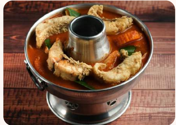
Hot And Sour Curry Barramundi แกงส้ม

Thai spicy and sour broth of soft pork ribs with lemongrass, kaffir lime leave, and a generous amount of chilli and lime juice.