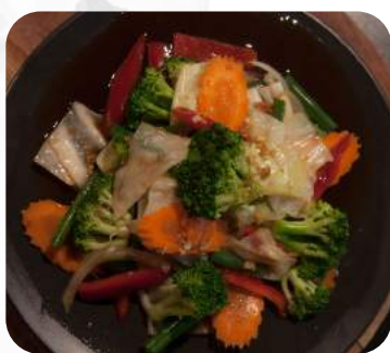
Stir Fried Mixed Vegetable

Stewed pork belly served with boiled asparagus