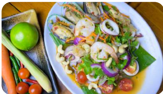
Yum Seafood ยำทะเลรวม $29.9

Deep fried fresh prawn cooked with chilli jam, slide lemongrass, red onion, lime juice and mint