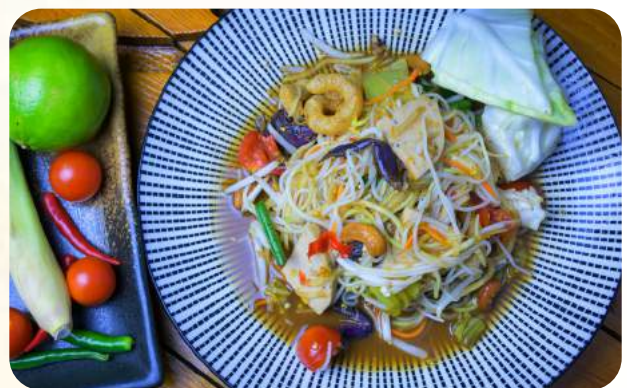
Som Tum Mua ส้มตำมั่ว

Choice of Som Tum Lao and Som Tum Thai served with vermicelli noodle, pork cracker, egg, blanched vegetables, chicken wing, fresh vegetables, peanut and pork sausage.