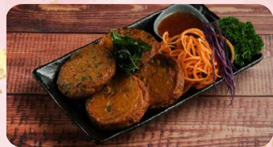
Fish Cake ทอดมันปลา (4 pcs) $11.9

Grilled chicken mid wing served with Thai chilli sauce.