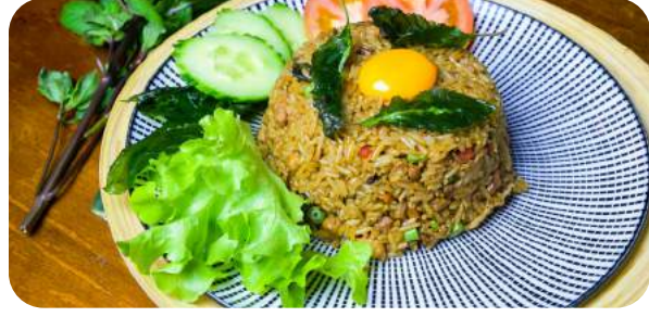
Thai Fried Rice Basil ข้าวผัดกระเพรา Your choice of meat stir fried with fresh chilli, basil, bamboo, and green bean.