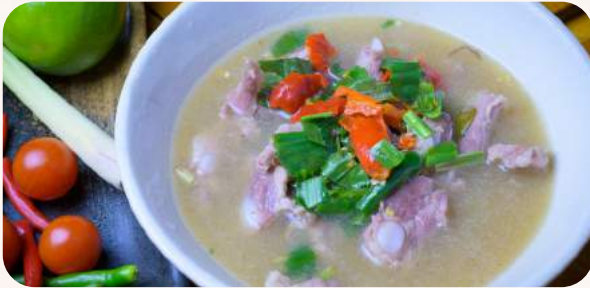
Soft Pork Rib Soup

Three kind of mushroom with tiliacora juice, lemon grass, chilli, mushroom and basil. (Thai Taste, Strong Favour)