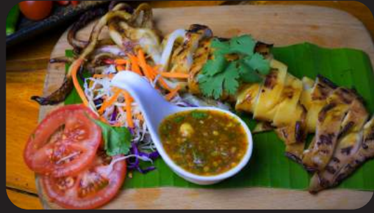
Grill Squid หมึกย่าง $21.9

Deep fried garlic and chives cake serve with Thai sweet soy sauce.