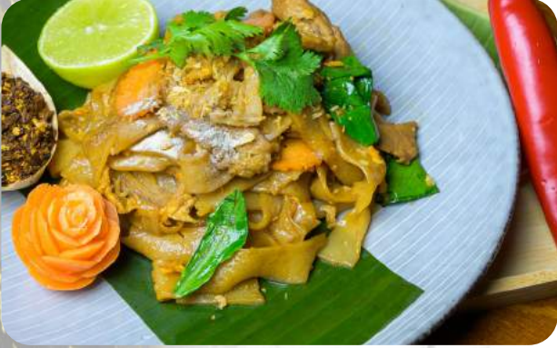
Pad See Ew ผัดซีอิ้ว Stir fried flat noodle with egg and Chinese broccoli.