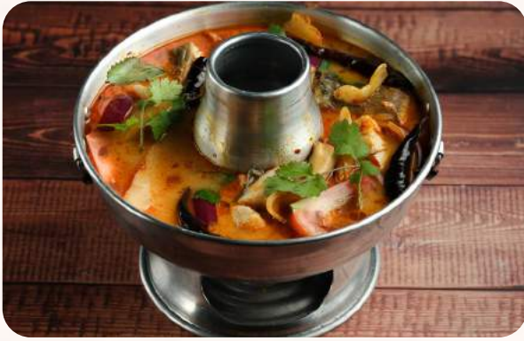
Tom Yum Seafood