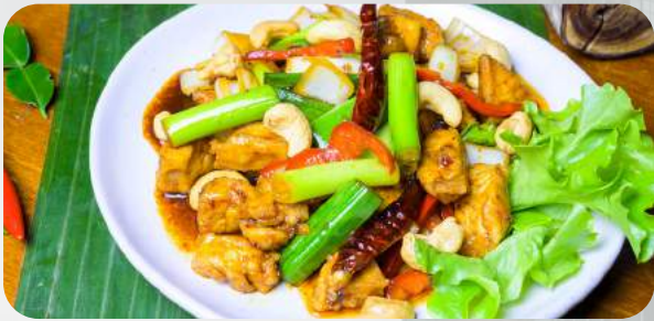
Cashew Nut ผัดเม็ดมะม่วง

Your own choice of meat stir fried with cashew nuts and vegetables.