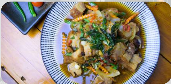
Thai Basil ผัดกระเพรา

Your choice of meat stir fried with egg, curry powder, onion and carrot.