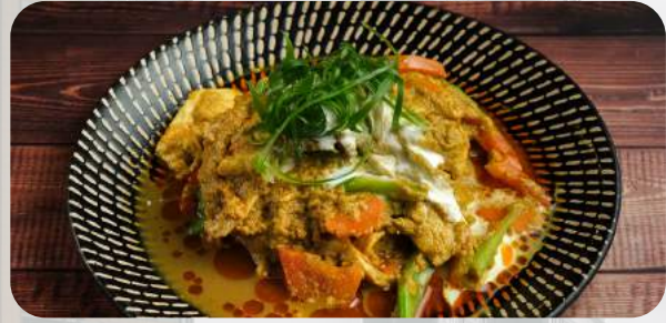
Stir Fried Curry ผัดผงกระหรี่

Your own choice of meat stir fried with cashew nuts and vegetables.