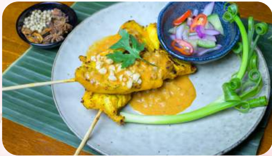
Chicken Satay ไก่สะเต๊ะ

Grilled pork ball served with Thai chilli sauce.