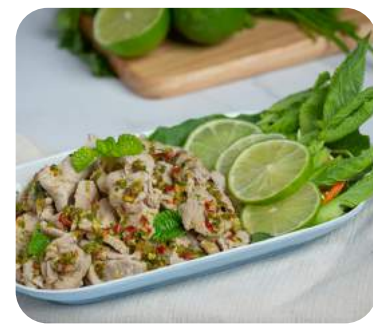
Pork with Chilli And Lime

Crispy pork stir fried Chinese broccoli with oyster sauce (can add fresh chilli)