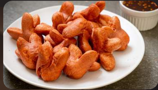
Deep Fried Sausages

beef jerky served with Thai chilli sauce.