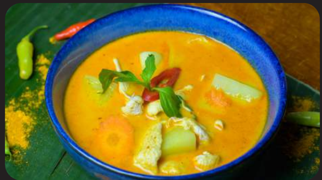
Yellow Curry แกงเหลือง

Choice of your meat with red curry paste, coconut milk with vegetables