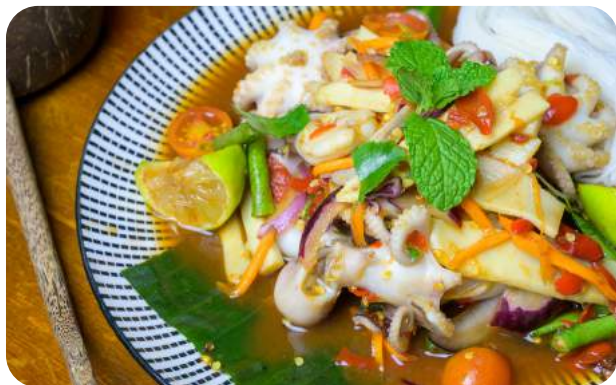
Tum Baby Octopus ตำหมึกสะดุ้ง

Raw salmon with fermented fish, red onion, chilli, lime, tomato, peanut and lotus flow.