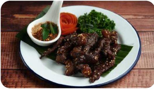
Beef One Sun