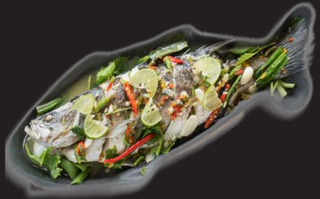
Steamed Barramundi with Lime And Chilli ปลาหนึ่งมะนาว $35.9

Deep fried barramundi served with Thai sauce : tamarind, dry chilli, onion and garlic.