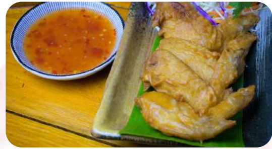
Fried Chicken Wings ไก่ทอด (4 pcs) $13.9

Home-Made Thai style pork stuffed with beansprouts and glass noodle served with our special dipping sauce.