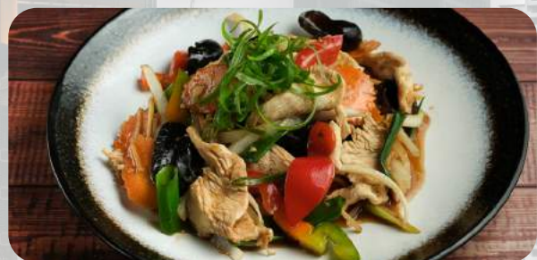
Stir Fried Ginger ผัดขิง

Your choice of meat stir fried with fresh chilli, basil, bamboo, and green bean.