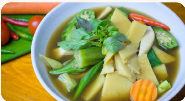
Thai Spicy Bamboo Shoot

Deep fried barramundi cooked with Thai hot and sour paste also Green bean, Carrot, coneflower (Thai Taste, Strong)