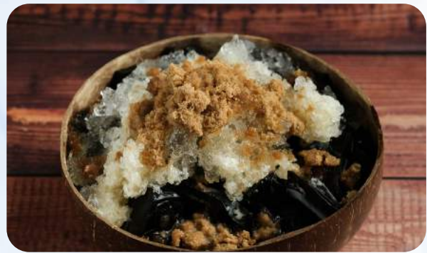
Glass Jelly Milk เจลาตีน