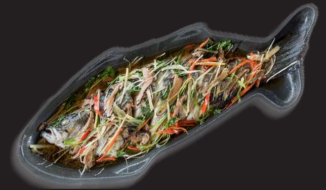
Steamed Barramundi Soy Sauce And Ginger ปลาหนึ่งซีอิ๊ว $35.9

Steamed barramundi and cabbage served with Thai sauce.