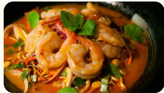
Spicy Prawn Salad พล่ากุ้ง $25.9

Glass noodle with pork mince, chili, lime juice, fish sauce, palm sugar, onion, shallot, mint, coriander, pork sausage, white fungus, peanuts and tomato.