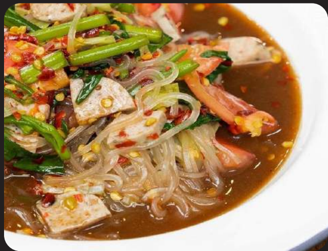
Tum Noodles Salad ต้มก๋วยเตี๋ยว $22.9

Bamboo shoot with Fermented fish sauce, chilli, Lime, mint and onion.