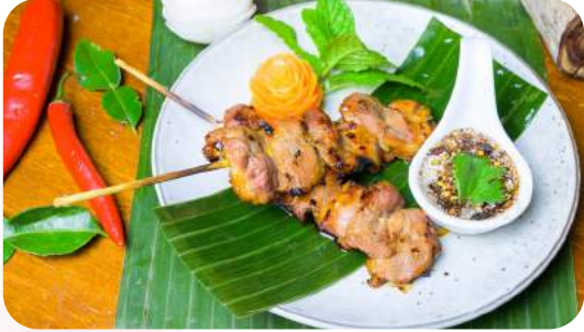
Grill Pork หมูปิ้ง