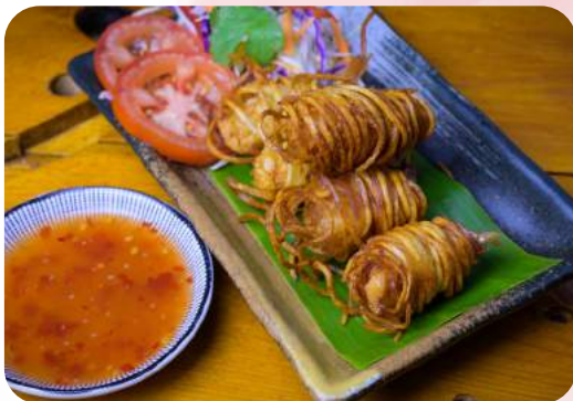
Potato Wrapped Prawn กุ้งพันสปาเกตตี้ (4 pcs) $13.9

Deep fried chicken mid wings served with sweet chilli sauce.