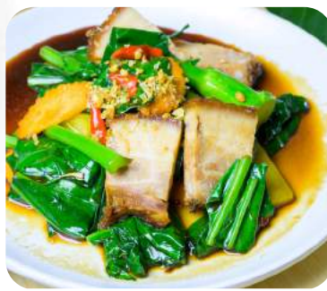
Kana Moo Krop

Stir fried Bok Choy, Carrot, Green bean, Chinese broccoli and Tofu.