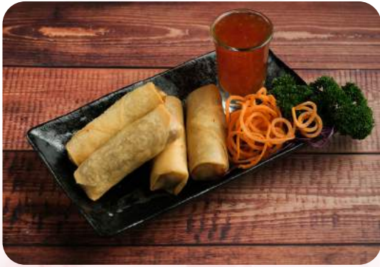
Set Spring Roll ชุดเมี่ยงปอเปี๊ยะ (4 pcs) V $13.9

Home-Made Thai style pork stuffed with beansprouts and glass noodle served with our special dipping sauce.