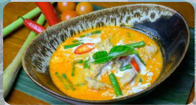
Panang Curry แกงพะเนียง

Chicken breast with green curry paste with vegetables, bamboo and basil.