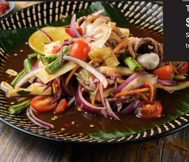
Tum Kao Lao Seafood ต้มกะหล่ำทะเล $32.9

Seafood with fermented fish, red onion, corn, chilli, lime, tomato, peanut and cilantro.